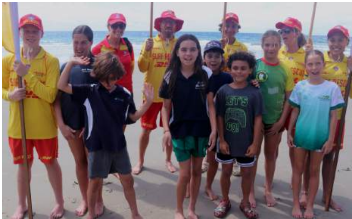
Port Douglas Surf Life Saving Club nippers and volunteers have some fun.