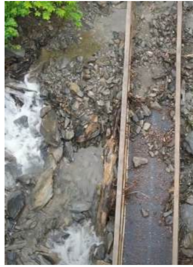
The 7.8km completed section of the Wangetti Trail is currently closed for repairs.

In the meantime, the current 7.8km section of the 94km Wangetti Trail project that has already