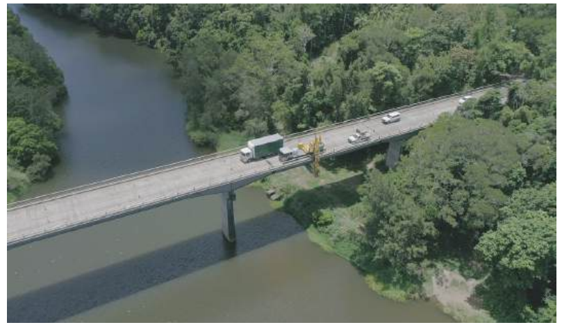
A 2020 inspection of the Barron River Bridge showed cracking in steel sections.

And $225m has been allocated for repairs to the Barron River Bridge on the Kennedy Highway