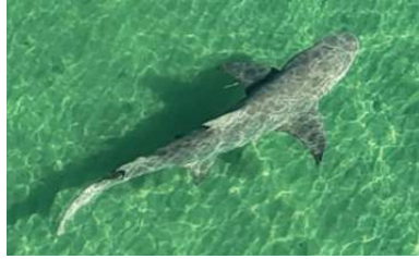
Drone footage of the shark.

The trapped shark follows another incident about a fortnight ago when a 1m crocodile also made its way into the same swimming enclosure.