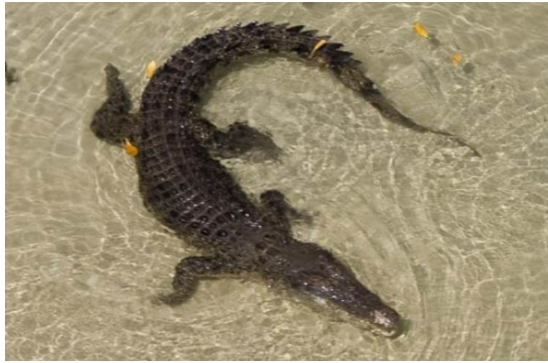
A committee is reviewing whether to push ahead with changing croc laws.