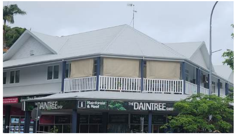
The venue of the proposed nightclub.

"Whether you're looking for a refined drink, a culinary delight, or a serene atmosphere to unwind, we provide the perfect escape to savour exceptional flavours in a beautiful setting."