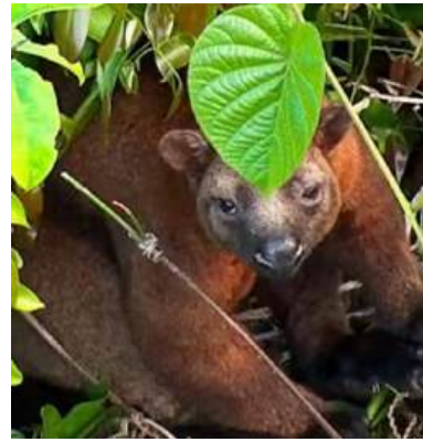
This Bennett's tree kangaroo was spotted by the James Cook University team.

"These techniques are less effective in the largely intact Bennett's tree kangaroo habitat where