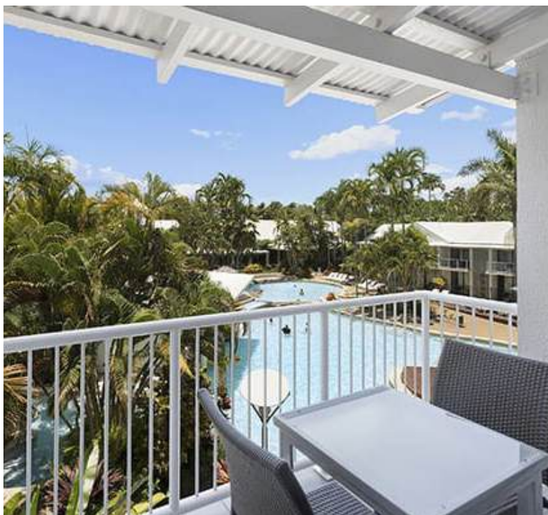
Valentine's Day bliss at Oaks Resort.

"It's a fantastic deal and an incredible value," he said. "It's per-