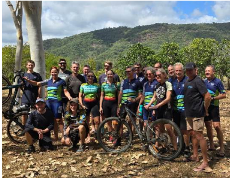
Rainforest and Reef Cycling Club is a thriving community.

of its greatest strengths. Unlike sports that require participants to maintain a similar fitness level, cycling allows riders of varying abilities to enjoy the experience together.