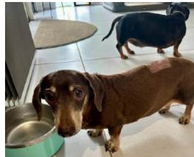
Slinky home with brother Domino

"On Monday December 30 at 10.30am, we got a call that changed everything. Our lovely neighbour's daughter spotted